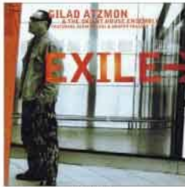
EXILE Gilad Atzmon & Orient House Ensemble